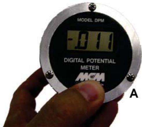
A – 3 SCREWS (Remove to get to Battery)