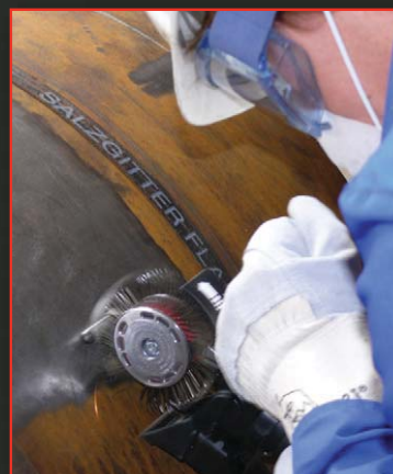
Newly Developed Bristle Blaster