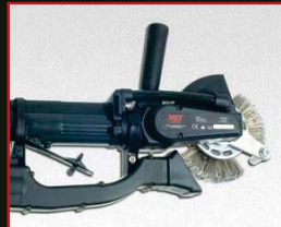
MBX Blaster Pneumatic USSP-06

Free Speed: 3,500 rpm Required Air Pressure: 90 psi Average Air Consumption: 4 cfm Interior Air Hose Size: 3/8" Weight: 2.4 lbs Warranty: 6 months