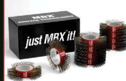
MBX Bristle Blaster Set USBU-110-23 Carbon Steel 23 mm width USBU-160-23 Stainless Steel 23 mm width

0.7 mm spring steel angled, ground and heat treated tips, OD:115mm 0.7mm surgical spring steel, ground tips, OD:115mm