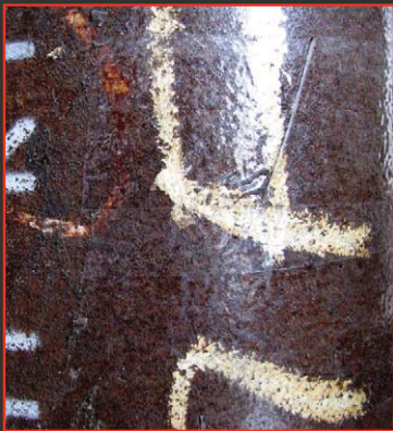
API 5L Piping