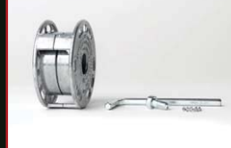
MBX Adapter System USAS-009-23 23 mm width

Made of high quality die cast aluminium, with safety elements