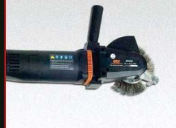
MBX Blaster Electric USSE-06

Free Speed: 3,500 rpm Required Air Pressure: 90 psi Average Air Consumption: 4 cfm Interior Air Hose Size: 3/8" Weight: 2.4 lbs Warranty: 6 months