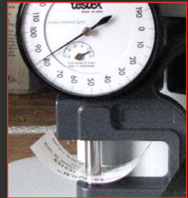
• 83 R 2 (3.3 mil)