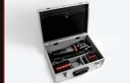
MBX Bristle Blaster Set USSE-06-02 Electric

The MBX System combines ease of use, superior performance and safety of operation in a versatile tool that handles a wide variety of surface preparation tasks.