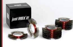
MBX Bristle Blaster Set USBU-110-11 Carbon Steel 11 mm width USBU-160-11 Stainless Steel 11 mm width

Free Speed: 3,200 rpm Voltage Rating: 120 v +/- 10% Amperes: 4 amps Weight: 4.0 pounds Warranty: 6 months