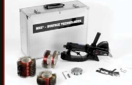
MBX Bristle Blaster Set USSP-06-02 Pneumatic

Made of high quality die cast aluminium, with safety elements