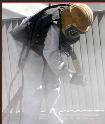
Conventional Grit Blasting