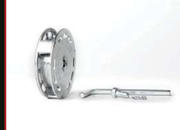
MBX Adapter System USAS-009-11 11 mm width

0.7 mm spring steel angled, ground and heat treated tips, OD:115mm 0.7mm surgical spring steel, ground tips, OD:115mm