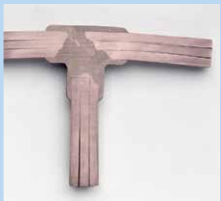
The CADWELD molecular bond will last the lifetime of the conductors.