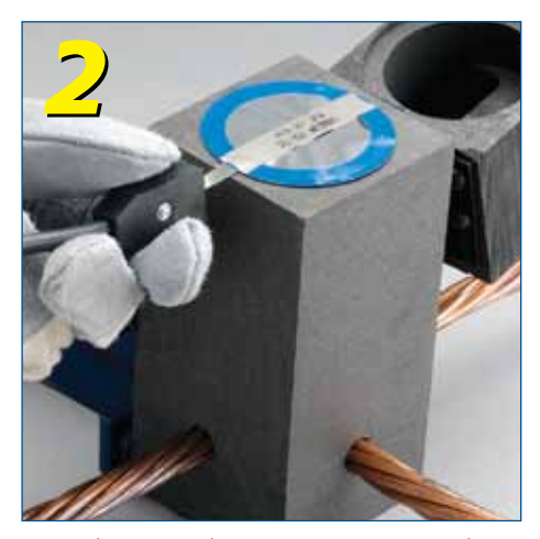
Attach control unit termination clip to ignition strip