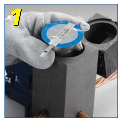
Insert CADWELD PLUS cup into mold (may require use of a cover/baffle)