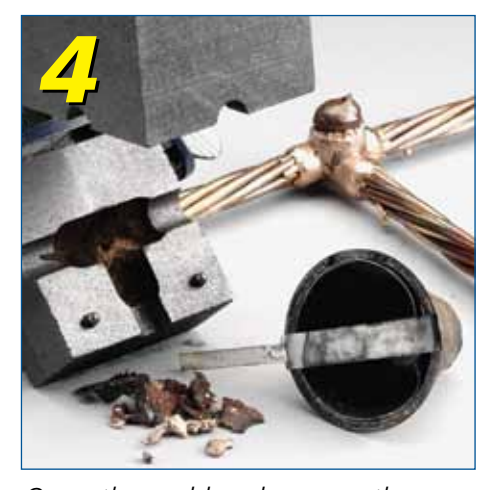
Open the mold and remove the expended steel cup – no special disposal required

CADWELD PLUS Control Unit initiates the reaction of the metal crucible. The standard unit includes a 6-foot (1.8 meter) high temperature control unit lead. The lead attaches to the ignition strip using a custom made, purpose-designed termination clip.