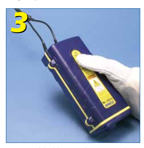
Press and hold control unit switch and wait for the ignition