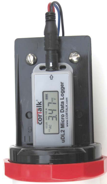
Positioned inside a CP test station