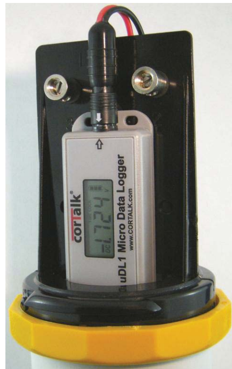
Positioned inside a CP test station