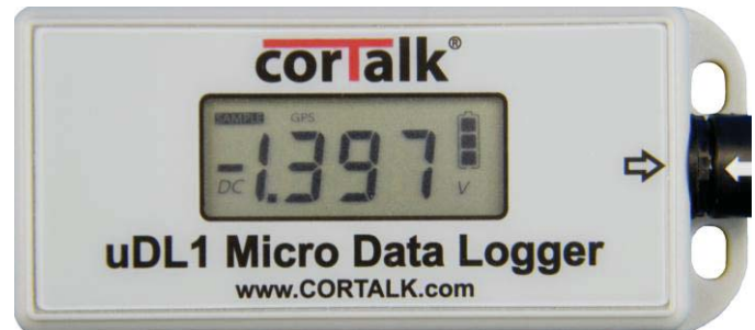
Approximate physical size

The uDL1 is a high accuracy, low cost data logger designed specifically for cathodic applications. The device is very simple to use and has a large LCD that can locally verify the readings. Measurement storage capacity of 500,000 or 1,000,000 readings and long life rechargeable battery allow the device to capture readings for over 6 months. An optional internal GPS receiver provides an accurate time reference and site geo-location coordinates. A small physical size and wide operating temperature range make this device ideally suited for general field use.