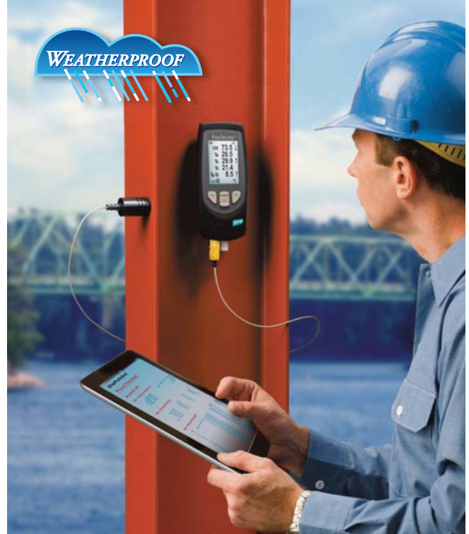
Analyze uploaded readings using a web browser from anywhere – jobsite or head office.