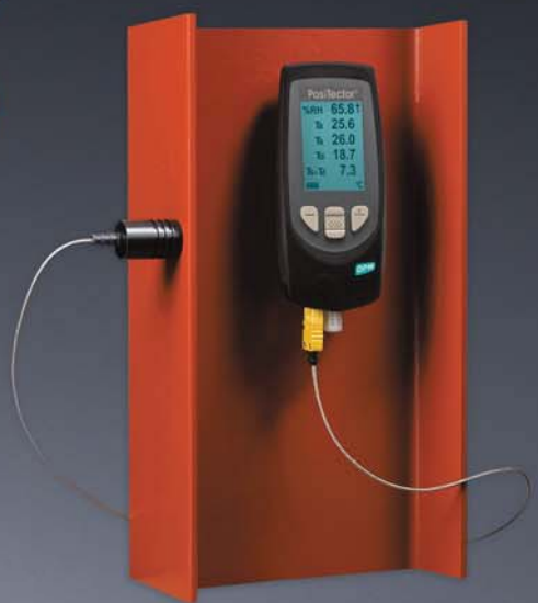
Standard model shown with separate probe

Relative humidity, air temperature, surface temperature, dew point temperature and difference between surface and dew point temperatures. Ideal for surface preparation as required by ISO 8502-4.