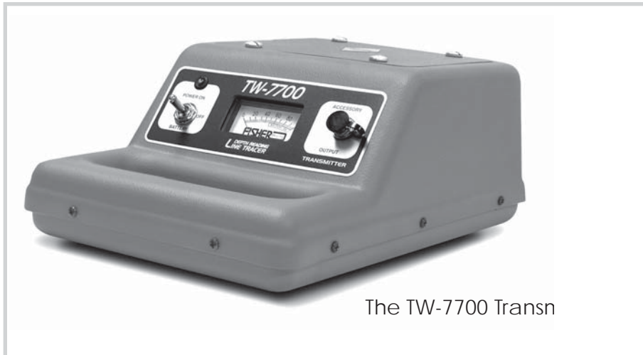
The TW-7700 Transn

WARNING: ELECTRIC SHOCK HAZARD: qualified personnel only.