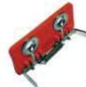
Shunts - 0.001?, 0.01?, 0.1?