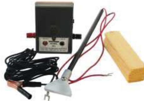
Model M/1 Low Voltage Holiday Detector Kit DC (battery powered) Portable Instrument