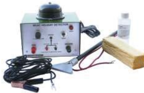
Model M1/AC Low Voltage Holiday Detector Kit AC power supply (110v) In-Plant Instrument