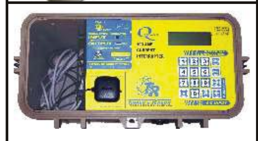
Cable Storage inside Case