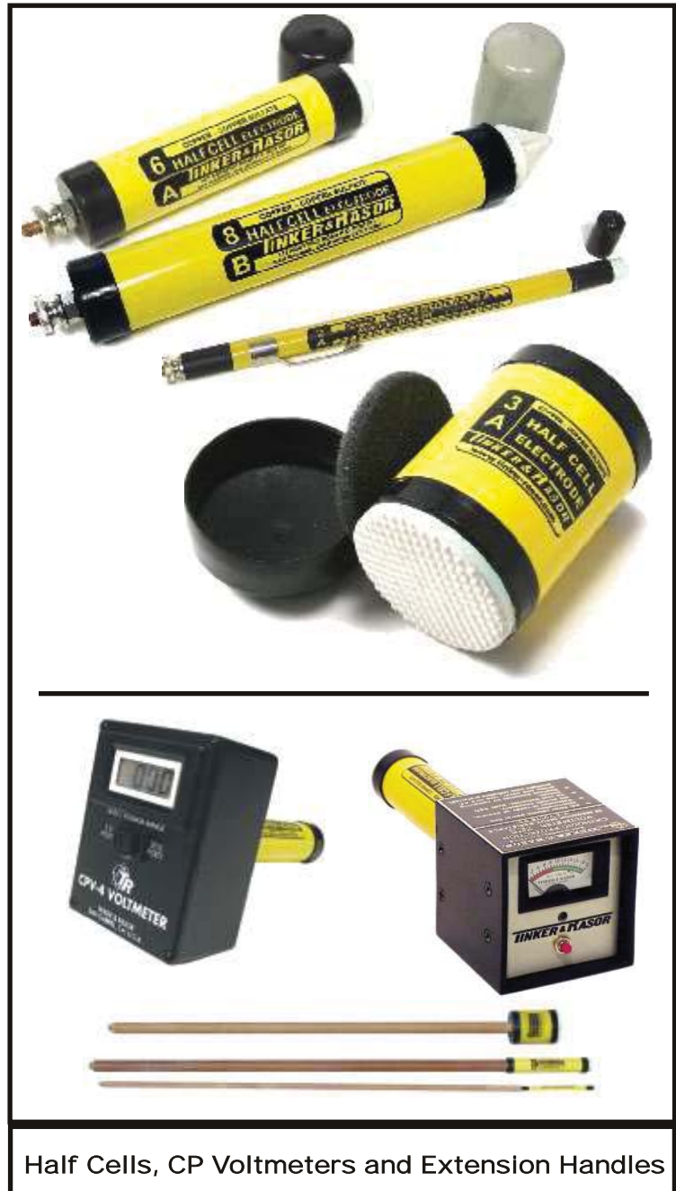
Half Cells, CP Voltmeters and Extension Handles