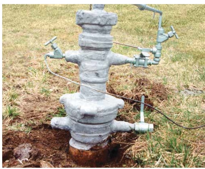
#2A Wax-Tape (aluminum pigmented) easily applied to a difficult-toprotect wellhead. Note the complete conformity to the irregular surfaces.

#2 Wax-Tape® is a microcrystalline wax blend saturated into a synthetic fabric that prevents corrosion of aboveground and belowground metal structures. Trenton Wax-Tapes have been successfully used as corrosion preventatives for over 25 years.