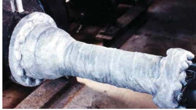
Sweating meter run pipe protected with #2A Wax-Tape.