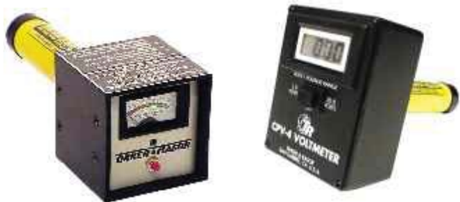
MODELS CPV-2 and CPV-4 Voltmeters